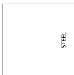
POWDER COATED STEEL